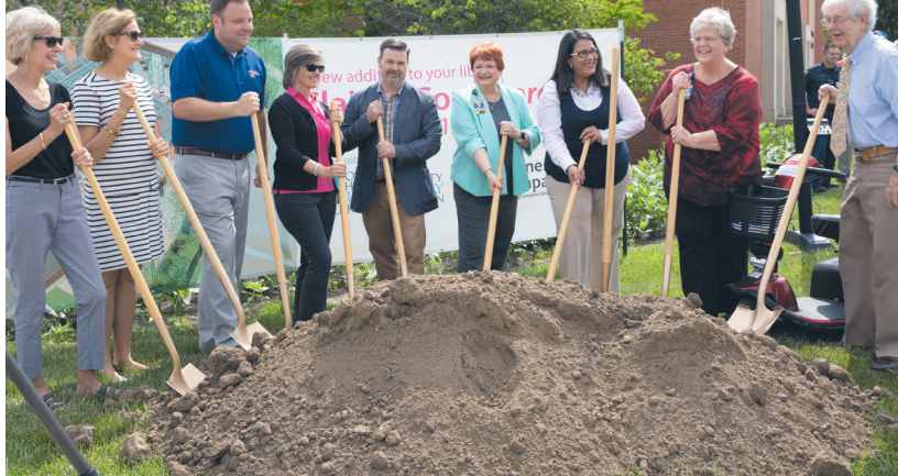
Groundbreaking for Claire's Courtyard

$1.3 million investment Funded by private gift